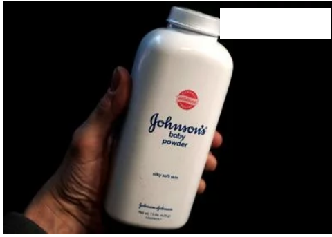
U.S. government experts, industry spar over asbestos testing in talc