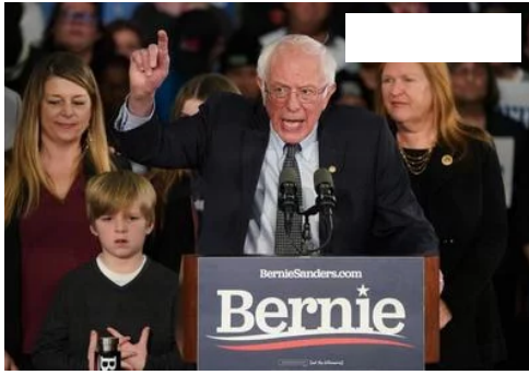
Iowa Democrats to release partial results after presidential caucus...