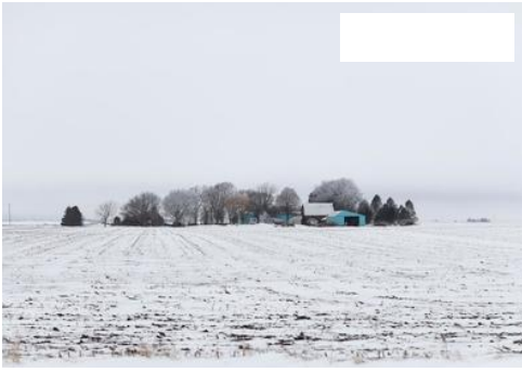
U.S. farm bankruptcies hit an eight-year high: court data