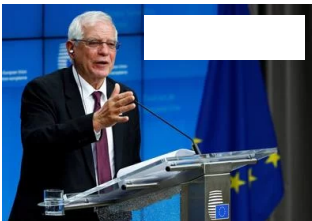
EU's top diplomat warns against Trump Middle East peace plan...