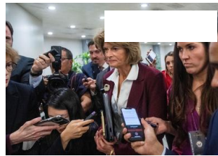
Republican Senator Murkowski spares few in fiery impeachment speech