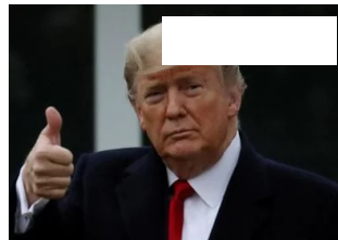
Democrats condemn Trump at trial as threat to American democracy