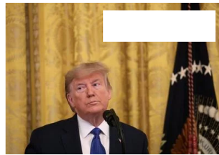
Dogged by impeachment, Trump goes head to head with Congress in big...