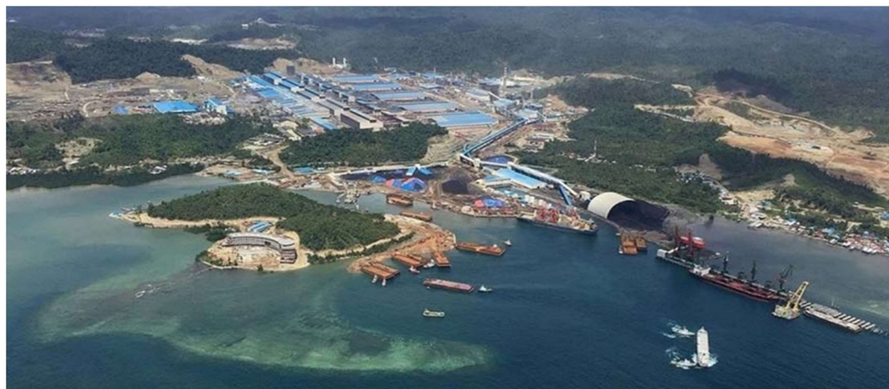
Aerial photo of the IMIP

Nickel Mines also holds an 80% interest in the long life, high grade Hengjaya nickel mine located in Morowali Regency, Central Sulawesi, Indonesia just 12 kilometres from the IMIP. The Hengjaya mine hosts a JORC 2012 compliant Resource of ~37.5 million dry metric tonnes at 1.81% nickel (0.7Mt Measured, 15.0Mt Indicated, 22.0Mt Inferred using a 1.5% nickel cut-off) ~680,000 tonnes of contained nickel metal.