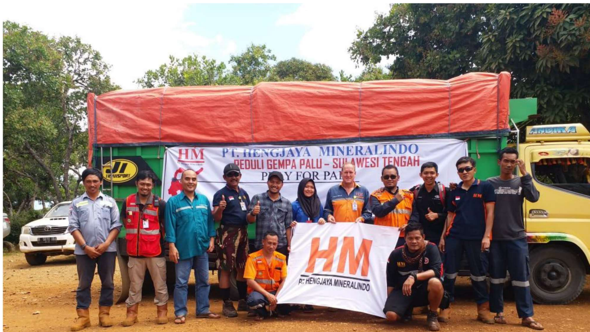
PT Hengjaya truck ready to leave site for Palu

The Company reports that neither its Hengjaya mine nor any of the IMIP operations were impacted by the earthquake. The Morowali Regency, where both operations exist, is on the eastern side of Sulawesi and not located near any of the higher risk earthquake subduction zones which occur throughout parts of Indonesia.