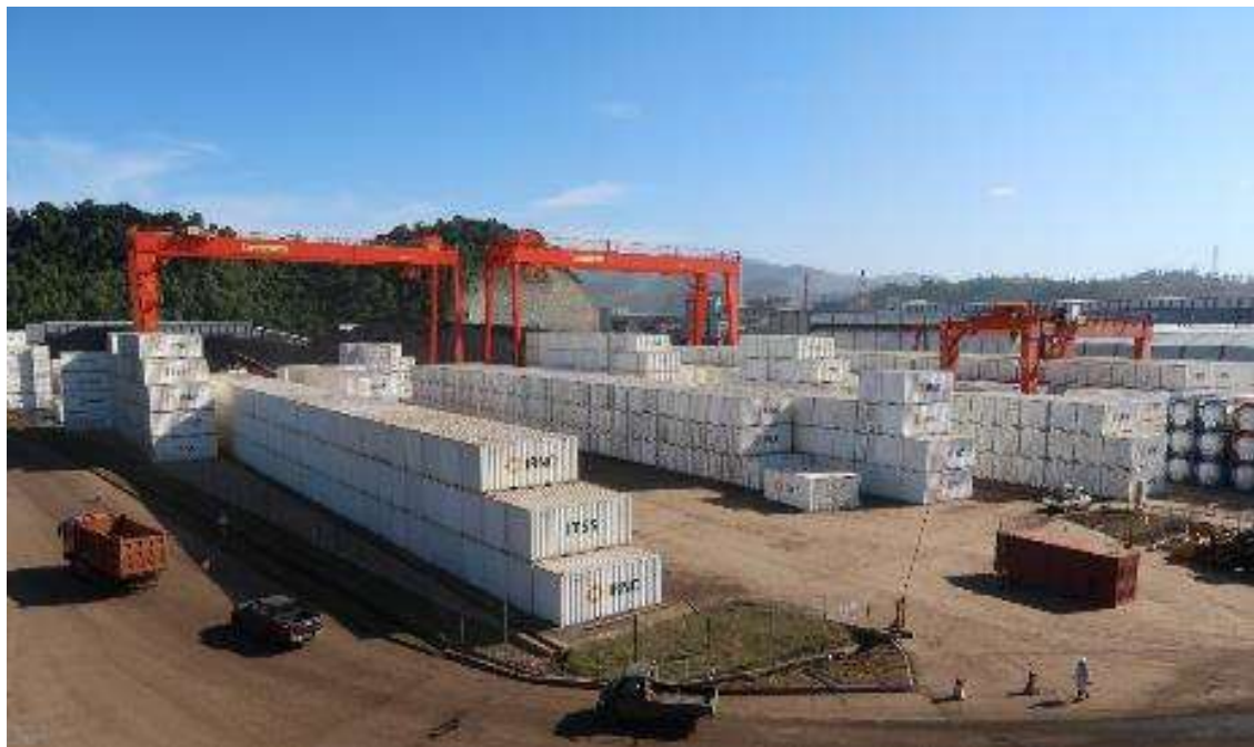
Shipping containers with IMIP equipment from China