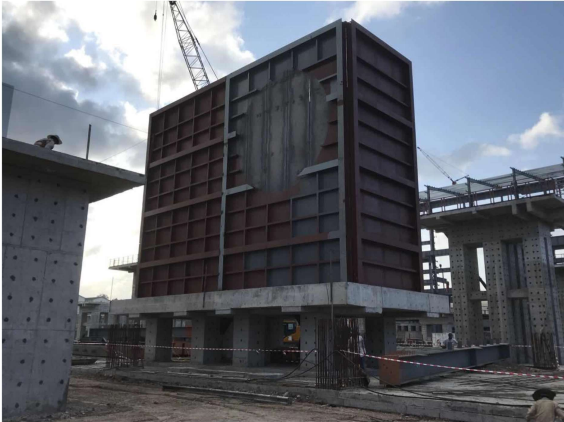
Hot blast stove