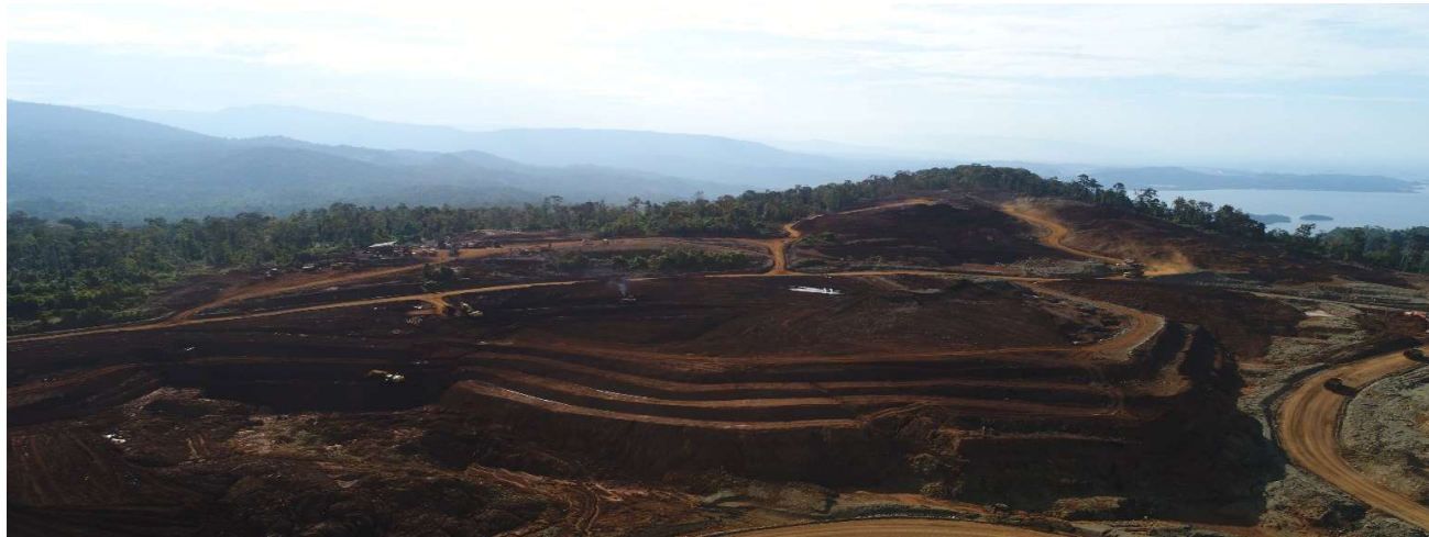
Aerial image of the Hengjaya Mine