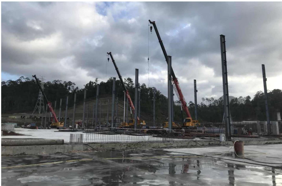
Dry ore plant