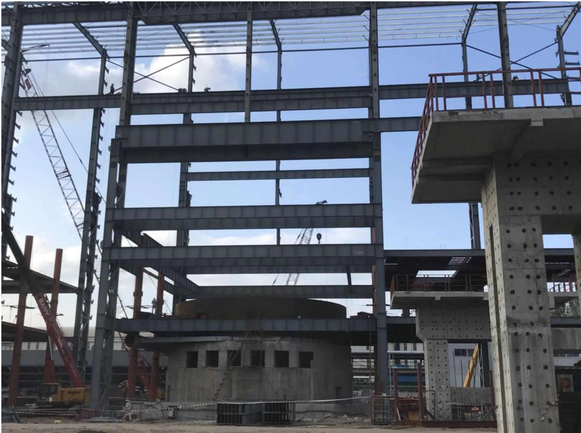
Support frame for rotary kiln, with base of electric furnace in the background